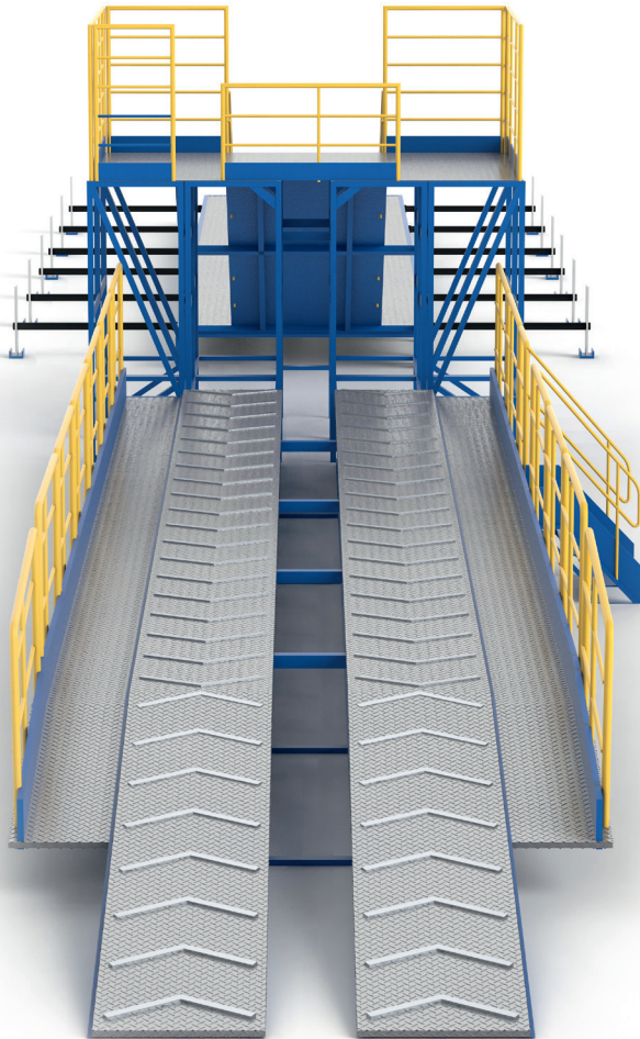
Drill site UPA 60-80

The company manufactures packaged, capacitive equipment, non-standard parts, and metal structures of in-house design and according to the customer's design documentation.